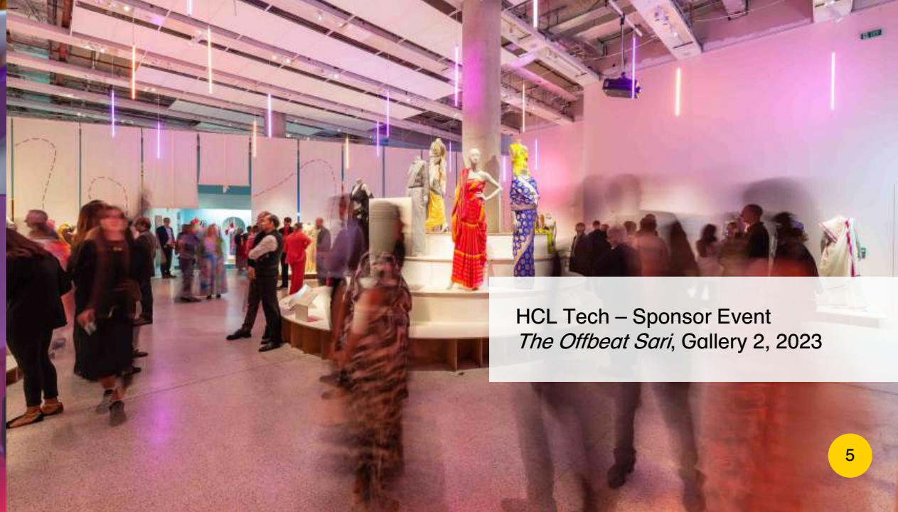
HCL Tech – Sponsor Event The Offbeat Sari , Gallery 2, 2023