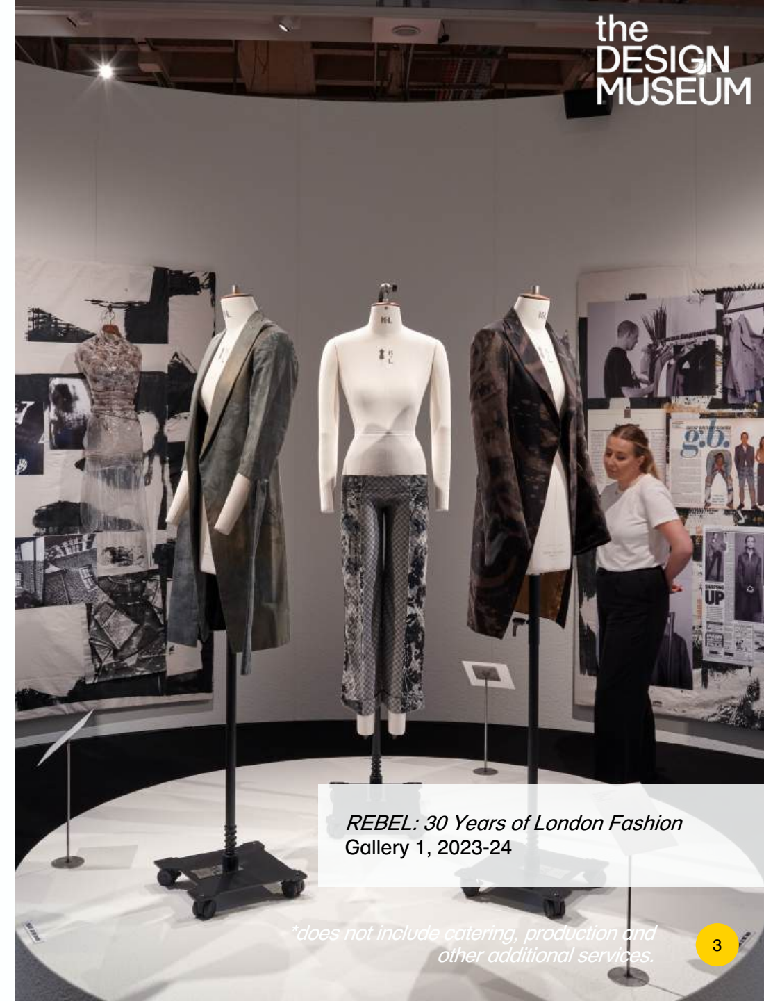
REBEL: 30 Years of London Fashion Gallery 1, 2023-24

*does not include catering, production and other additional services.